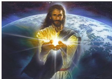
Jesus, the light of the world!