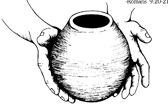
Roseburg Seventh-day Adventist Church September 19, 2015